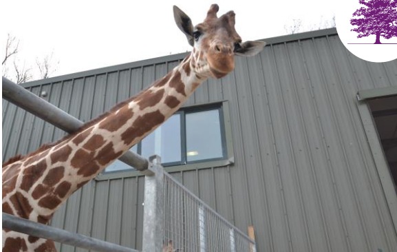
Noah's Ark Zoo Farm